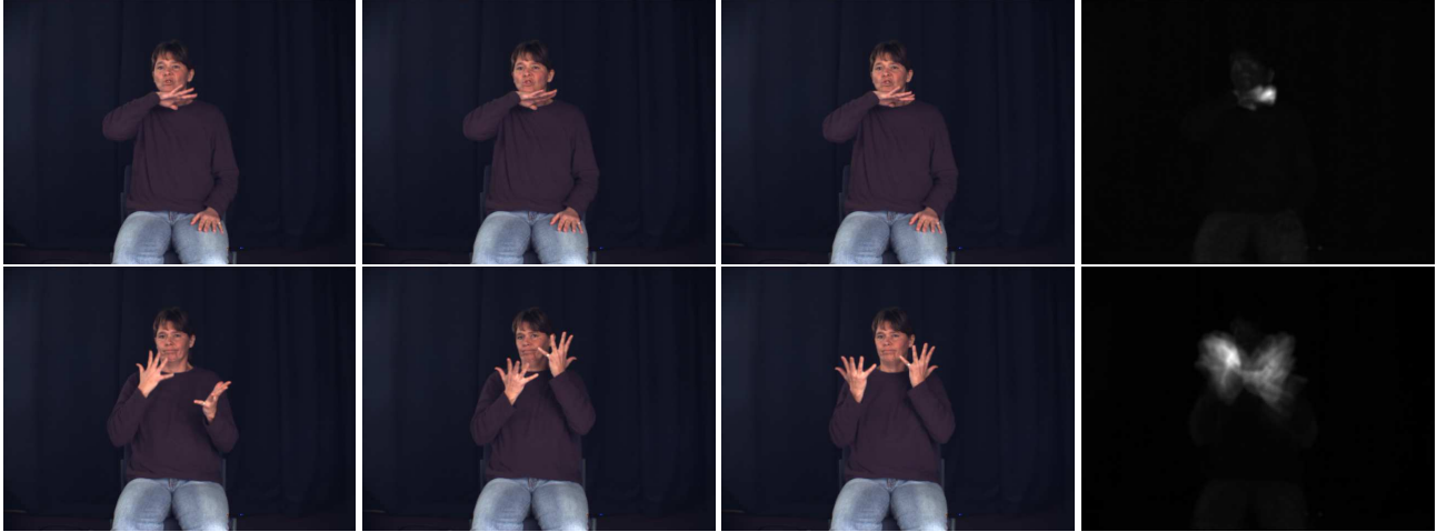
Figure 3. Examples of signs for which the correct class was ranked first (which is the best possible result) even without using one-handed vs. two-handed information. For each sign, we show, from left to right, the first frame, a middle frame, the last frame, and the blurred motion energy image. Top: an example of the sign DIRTY. Bottom: an example of the sign EMBARRASSED.