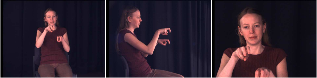
Figure 1. One of the frontal views (left), the side view (middle), and the face view (right), for a frame of a video sequence in the ASL Lexicon Video Dataset. The frame is from a production of the sign MERRY-GO-ROUND.

We believe that the video and annotations in our dataset will be a valuable resource for researchers in sign language recognition, gesture recognition, and human activity analysis. The video and annotations can be used to build models and train classifiers for a comprehensive set of ASL signs. The dataset can also be useful for benchmarking different methods and for helping showcase new and better methods for gesture and sign recognition that significantly improve on the current state of the art.