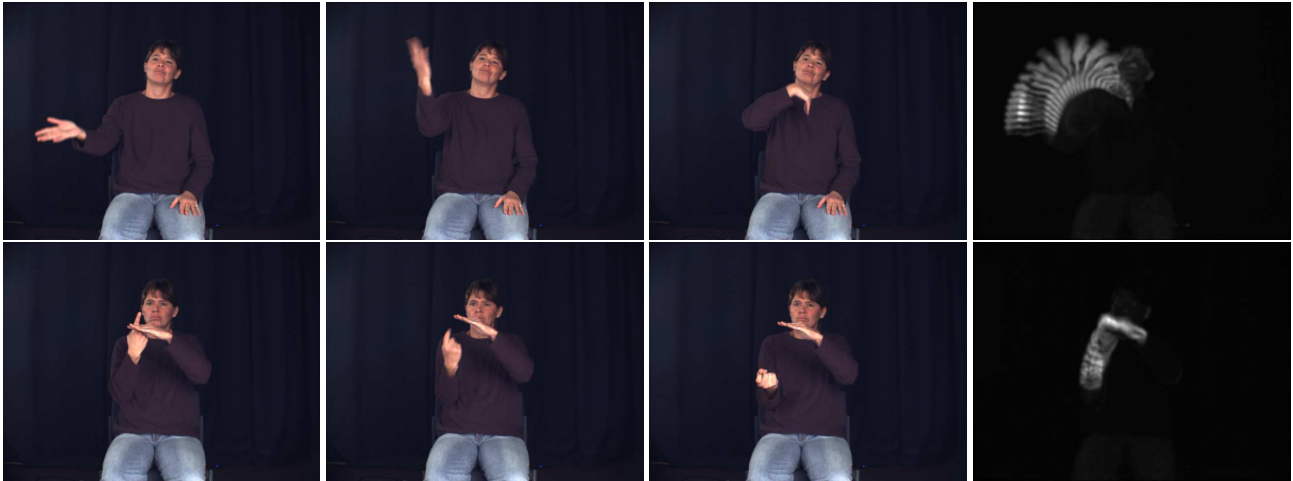
Figure 4. Examples of signs for which the correct class was ranked very low, even using using one-handed vs. two-handed information. For each sign, we show, from left to right, the first frame, a middle frame, the last frame, and the blurred motion energy image. Top: an example of the sign COME-ON, where no face was detected and the rank of the correct class was 299. Bottom: an example of the sign DISAPPEAR, where the rank of the correct class was 643.

tivity analysis, by providing a large amount of data that can be used for training and testing, and by providing a public benchmark dataset on which different methods can be evaluated. At the same time, some of the challenges posed by this dataset are relevant more broadly to researchers in the computer vision, machine learning, and data mining communities. Such challenges include the difficulty of discriminating among thousands of sign classes, and the need for efficiency in training and classification algorithms involving massive amounts of video data.